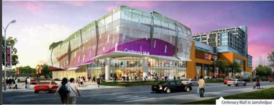
Centenary Mall in Jamshedpur

➤ Forum II –Kolkata- 10 lac sq ft. (Upcoming)