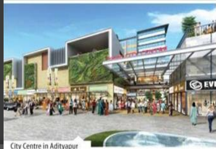
City Centre in Adityapur