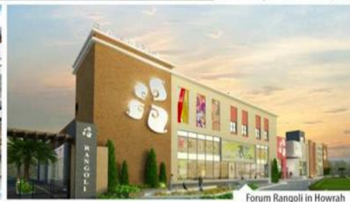
Forum Rangoli in Howrah