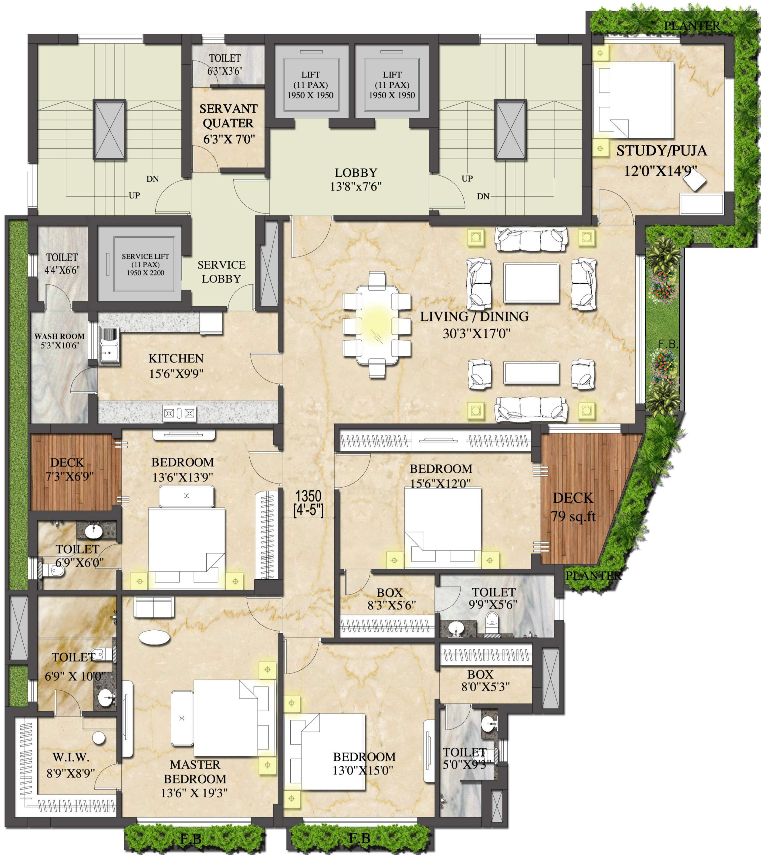
TYPICAL FLOOR PLAN ( 2ND - 4TH FLOOR PLAN )